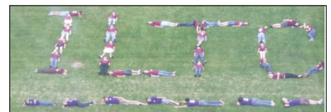
It takes a team to spell ILTC!

The registration forms and further information can be found online at www.iowastudentcouncils.org .