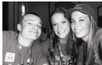
Iowa student board members at the National Conference

I am really excited about these new changes in the Honor Council program and look forward to another successful year.