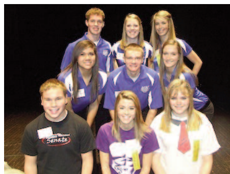
IASC Student Board Members