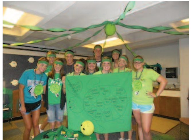
Campers “dive into leadership” at ILTC Camp '11

3 Make payment by check only. Do not send cash. Make checks payable to School Administrators of Iowa (SAI). Please send $350 per delegate with the completed registration form below to: SAI, Attn: Iowa Leadership Camp, 12199 Stratford Drive, Clive, IA 50325. Registration fee after May 1 is $450.